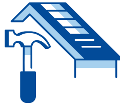
Roof Leak Repair Coverage